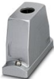
HEAVYCON ADVANCE standard powder-coated sleeve housing B16, with screw locking, height 100 mm, with 1x M25 thread, straight cable outlet

Please be informed that the data shown in this PDF Document is generated from our Online Catalog. Please find the complete data in the user's documentation. Our General Terms of Use for Downloads are valid ( http://download.phoenixcontact.com )