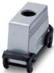
HEAVYCON B16 coupling housing, with double locking latch, height: 80 mm, with 1 x M40 thread, straight cable outlet, with seal

Please be informed that the data shown in this PDF Document is generated from our Online Catalog. Please find the complete data in the user's documentation. Our General Terms of Use for Downloads are valid ( http://download.phoenixcontact.com )