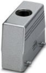
HEAVYCON B24 sleeve housing, for double locking latch, height: 76 mm, with 1 x M25 thread, straight cable outlet

Please be informed that the data shown in this PDF Document is generated from our Online Catalog. Please find the complete data in the user's documentation. Our General Terms of Use for Downloads are valid ( http://download.phoenixcontact.com )