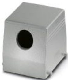
HEAVYCON sleeve housing B 32, for double locking latch, height 80 mm, without support 1x M32, lateral conductor exit

Please be informed that the data shown in this PDF Document is generated from our Online Catalog. Please find the complete data in the user's documentation. Our General Terms of Use for Downloads are valid ( http://phoenixcontact.com/download )