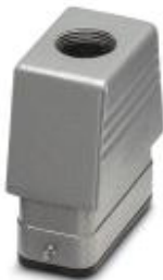
HEAVYCON sleeve housing D15 for single locking latch, height 66 mm, without support 1x M20, straight conductor exit

Please be informed that the data shown in this PDF Document is generated from our Online Catalog. Please find the complete data in the user's documentation. Our General Terms of Use for Downloads are valid ( http://download.phoenixcontact.com )