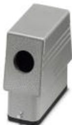
HEAVYCON sleeve housing D25, for single locking latch, height 72 mm, without support 1x M25, lateral conductor exit

Please be informed that the data shown in this PDF Document is generated from our Online Catalog. Please find the complete data in the user's documentation. Our General Terms of Use for Downloads are valid ( http://phoenixcontact.com/download )