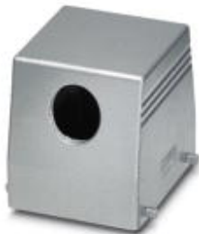
HEAVYCON sleeve housing D50, for double locking latch, height 76 mm, without support 1x M32, lateral conductor exit

Please be informed that the data shown in this PDF Document is generated from our Online Catalog. Please find the complete data in the user's documentation. Our General Terms of Use for Downloads are valid ( http://phoenixcontact.com/download )