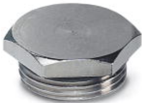
Filler plug, metal, size: M40

Please be informed that the data shown in this PDF Document is generated from our Online Catalog. Please find the complete data in the user's documentation. Our General Terms of Use for Downloads are valid ( http://download.phoenixcontact.com )