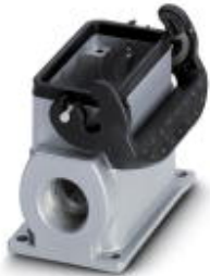
HEAVYCON box mounting base B10, with single locking latch, height 74 mm, with supports 1xM32

Please be informed that the data shown in this PDF Document is generated from our Online Catalog. Please find the complete data in the user's documentation. Our General Terms of Use for Downloads are valid ( http://phoenixcontact.com/download )