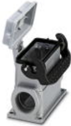
HEAVYCON box mounting base B6, with single locking latch and cover, height 74 mm, with support 2xM32

Please be informed that the data shown in this PDF Document is generated from our Online Catalog. Please find the complete data in the user's documentation. Our General Terms of Use for Downloads are valid ( http://phoenixcontact.com/download )