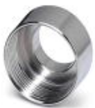
Step-up adapter, M32 to M40, including O-ring

Extension adapter - ENLAR-M-KV-M32/M40 - 1647682