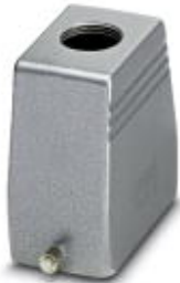
HEAVYCON B10 sleeve housing, for single locking latch, height: 72 mm, with 1 x M20 thread, straight cable outlet

Please be informed that the data shown in this PDF Document is generated from our Online Catalog. Please find the complete data in the user's documentation. Our General Terms of Use for Downloads are valid ( http://download.phoenixcontact.com )