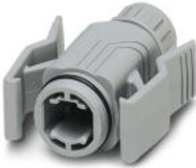
RJ45 sleeve housing, IP67, for pin insert VS-08-ST-H11-RJ45 and VS-08-ST-H21-RJ45, with push-pull interlocking for panel mounting frames, for cable cross section 5.0 mm ... 8.5 mm, color: gray

Please be informed that the data shown in this PDF Document is generated from our Online Catalog. Please find the complete data in the user's documentation. Our General Terms of Use for Downloads are valid ( http://download.phoenixcontact.com )