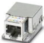
RJ45 socket insert, for the Freenet system, CAT5e, 8-pos., shielded, with cable connection (IDC fast connection), for solid wires AWG 24 ... 22

RJ45 female insert - VS-08-BU-RJ45-5-F/PK - 1652936