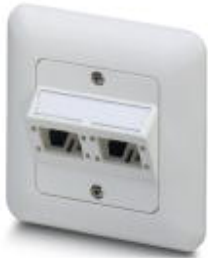
Terminal outlet, flush-type mounting, IP20, two slots for contact inserts with the Freenet system

Please be informed that the data shown in this PDF Document is generated from our Online Catalog. Please find the complete data in the user's documentation. Our General Terms of Use for Downloads are valid ( http://download.phoenixcontact.com )