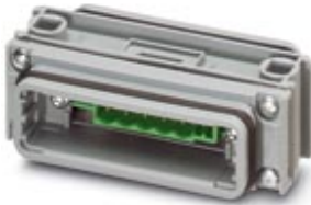
D-SUB coupling, for DeviceNet, shell size 3, header, unshielded, connection direction straight, IP67 degree of protection

Please be informed that the data shown in this PDF Document is generated from our Online Catalog. Please find the complete data in the user's documentation. Our General Terms of Use for Downloads are valid ( http://download.phoenixcontact.com )