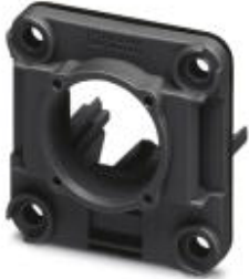
RJ45 panel mounting frame, IP67, irradiated for welding applications, for Freenet system, for round panel cutout, with grommet, without mounting screws

Please be informed that the data shown in this PDF Document is generated from our Online Catalog. Please find the complete data in the user's documentation. Our General Terms of Use for Downloads are valid ( http://download.phoenixcontact.com )