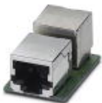
RJ45 socket insert, for the Freenet system, CAT5e, 8-pos., shielded, socket on socket

RJ45 female insert - VS-08-BU-RJ45-5-F/BU - 1652952