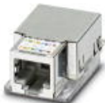
RJ45 socket insert, for the Freenet system, CAT5e, 8-pos., shielded, with cable connection (IDC fast connection), for solid wires AWG 24 ... 22

RJ45 female insert - VS-08-BU-RJ45-5-F/PK - 1652936