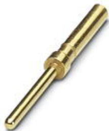
Crimp contact, for D-SUB contact inserts with high density, pin, connection cross section AWG 22, turned, gold-plated

Please be informed that the data shown in this PDF Document is generated from our Online Catalog. Please find the complete data in the user's documentation. Our General Terms of Use for Downloads are valid ( http://phoenixcontact.com/download )