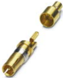
Coaxial contact, for D-SUB combination inserts, solder cup, socket, straight, for cable RG -178, gold-plated

Please be informed that the data shown in this PDF Document is generated from our Online Catalog. Please find the complete data in the user's documentation. Our General Terms of Use for Downloads are valid ( http://phoenixcontact.com/download )