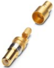
Coaxial contact, for D-SUB combination inserts, solder cup, socket, straight, for cable RG 174, gold-plated

Please be informed that the data shown in this PDF Document is generated from our Online Catalog. Please find the complete data in the user's documentation. Our General Terms of Use for Downloads are valid ( http://phoenixcontact.com/download )