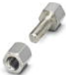
Mounting set, for DSUB gender changer contact inserts