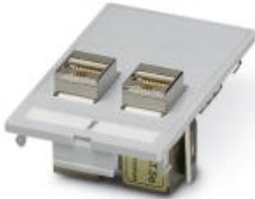
Illustration shows the product version VS-SI-FP-2RJ45-5-MOD-BU/BU

Front plate with contact inserts, plastic, 1x D-SUB 9 and 1x D-SUB 25, socket/pin