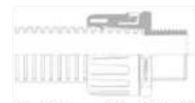
Conduit complete with FPA fitting