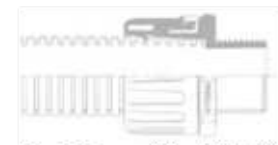
Conduit complete with FPA fitting