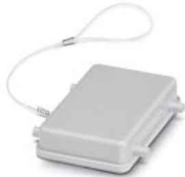
HEAVYCON protective cover, type D50, for supporting base element with single locking latch, with retaining cord, IP54, PA

Please be informed that the data shown in this PDF Document is generated from our Online Catalog. Please find the complete data in the user's documentation. Our General Terms of Use for Downloads are valid ( http://download.phoenixcontact.com )