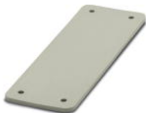
HEAVYCON cover plate, for panel cutouts of type B16/HV6, 3.5 mm thick, gray

Please be informed that the data shown in this PDF Document is generated from our Online Catalog. Please find the complete data in the user's documentation. Our General Terms of Use for Downloads are valid ( http://phoenixcontact.com/download )