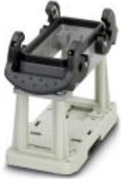
HEAVYCON connector assembly frame with panel mounting base with single locking latch, for contact inserts of type B6

Please be informed that the data shown in this PDF Document is generated from our Online Catalog. Please find the complete data in the user's documentation. Our General Terms of Use for Downloads are valid ( http://download.phoenixcontact.com )