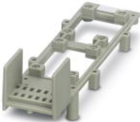
Plug receptacle, for plug assembly board, with strain relief, for accommodating contact inserts, type HC-B 6 (2 x)

Please be informed that the data shown in this PDF Document is generated from our Online Catalog. Please find the complete data in the user's documentation. Our General Terms of Use for Downloads are valid ( http://download.phoenixcontact.com )