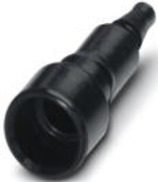
Pneumatic socket, for HC-M-PN3 module, internal hose diameter of 3.0 mm

Please be informed that the data shown in this PDF Document is generated from our Online Catalog. Please find the complete data in the user's documentation. Our General Terms of Use for Downloads are valid ( http://phoenixcontact.com/download )