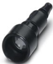
Pneumatic socket with valve, for HC-M-PN3 module, internal hose diameter of 3.0 mm

Please be informed that the data shown in this PDF Document is generated from our Online Catalog. Please find the complete data in the user's documentation. Our General Terms of Use for Downloads are valid ( http://phoenixcontact.com/download )