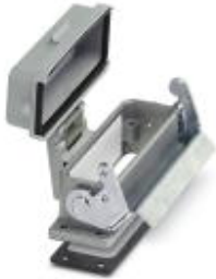
HEAVYCON panel mounting base D25, with single locking latch, height 26 mm, with cover

Please be informed that the data shown in this PDF Document is generated from our Online Catalog. Please find the complete data in the user's documentation. Our General Terms of Use for Downloads are valid ( http://phoenixcontact.com/download )