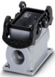
Box mounting base, with double locking latch, height 52 mm, without screw connection, 1x Pg16

Please be informed that the data shown in this PDF Document is generated from our Online Catalog. Please find the complete data in the user's documentation. Our General Terms of Use for Downloads are valid ( http://phoenixcontact.com/download )