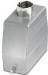
Sleeve housing, for single locking latch, height 65 mm, without screw connection, 1x Pg21, straight cable entry

Please be informed that the data shown in this PDF Document is generated from our Online Catalog. Please find the complete data in the user's documentation. Our General Terms of Use for Downloads are valid ( http://download.phoenixcontact.com )