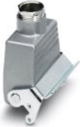
Coupling housing, with single locking latch, height 48 mm, with screw connection, 1x Pg16

Please be informed that the data shown in this PDF Document is generated from our Online Catalog. Please find the complete data in the user's documentation. Our General Terms of Use for Downloads are valid ( http://phoenixcontact.com/download )