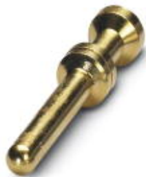
Turned 2.5 crimp contact, individual male contact, core diameter 0.75 to 1.0 mm 2 , gold-plated

Please be informed that the data shown in this PDF Document is generated from our Online Catalog. Please find the complete data in the user's documentation. Our General Terms of Use for Downloads are valid ( http://phoenixcontact.com/download )