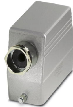
Figure shows product variant with screw connection.

http://eshop.phoenixcontact.de/phoenix/treeViewClick.do?UID=1677746