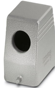
Figure shows product variant with thread.

http://eshop.phoenixcontact.de/phoenix/treeViewClick.do?UID=1677762