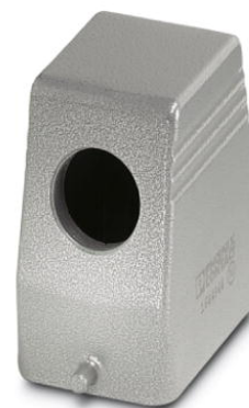
Figure shows product variant with thread.

http://eshop.phoenixcontact.de/phoenix/treeViewClick.do?UID=1678208