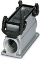
Box mounting base, with double locking latch, height 84 mm, without screw connection, 2x Pg29

Please be informed that the data shown in this PDF Document is generated from our Online Catalog. Please find the complete data in the user's documentation. Our General Terms of Use for Downloads are valid ( http://phoenixcontact.com/download )