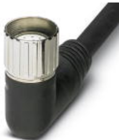
M23 socket, angled, 12-pos., with 5 m master cable, pin 9 and 10 bridged

Please be informed that the data shown in this PDF Document is generated from our Online Catalog. Please find the complete data in the user's documentation. Our General Terms of Use for Downloads are valid ( http://phoenixcontact.com/download )