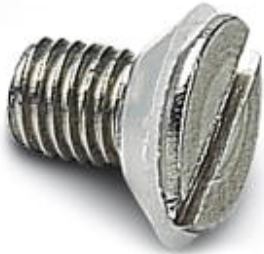
Sealing screw, size: Countersunk head V, IP67, replacement part for D7 size HEAVYCON housing

Please be informed that the data shown in this PDF Document is generated from our Online Catalog. Please find the complete data in the user's documentation. Our General Terms of Use for Downloads are valid ( http://phoenixcontact.com/download )