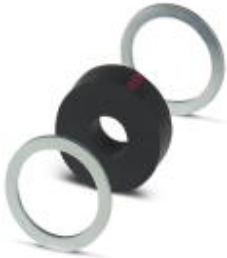
Notched seals/2 washers, for pressure screws, type Pg21

Please be informed that the data shown in this PDF Document is generated from our Online Catalog. Please find the complete data in the user's documentation. Our General Terms of Use for Downloads are valid ( http://download.phoenixcontact.com )