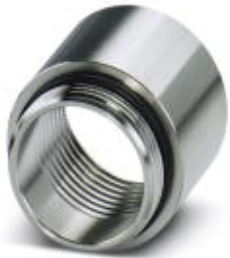
NPT adapter, IP68, up to 5 bar, incl. O-ring seal, M32 to 1"

Please be informed that the data shown in this PDF Document is generated from our Online Catalog. Please find the complete data in the user's documentation. Our General Terms of Use for Downloads are valid ( http://phoenixcontact.com/download )