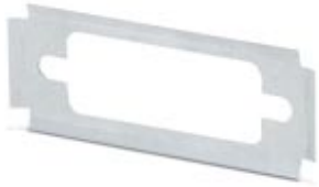
D-SUB EMC shroud, shell size 2, shielded, for panel mounting frame VS-15-...

Please be informed that the data shown in this PDF Document is generated from our Online Catalog. Please find the complete data in the user's documentation. Our General Terms of Use for Downloads are valid ( http://download.phoenixcontact.com )