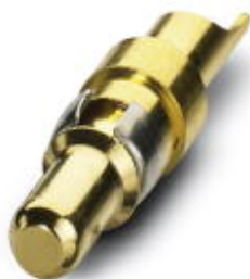
Power contacts, for D-SUB combination inserts, pin, solder cup, straight, rated current 20 A, gold-plated

Please be informed that the data shown in this PDF Document is generated from our Online Catalog. Please find the complete data in the user's documentation. Our General Terms of Use for Downloads are valid ( http://phoenixcontact.com/download )