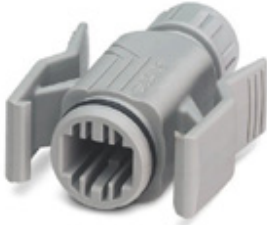
RJ45 sleeve housing, IP67, for pin insert VS-08-ST-RJ45, with push-pull interlocking for panel mounting frames, for cable cross section 5.0 mm ... 6.5 mm

Please be informed that the data shown in this PDF Document is generated from our Online Catalog. Please find the complete data in the user's documentation. Our General Terms of Use for Downloads are valid ( http://download.phoenixcontact.com )