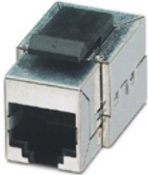
RJ45 socket insert, modular (Keystone), CAT3, 8-pos., shielded, with cable connection (IDC)

Please be informed that the data shown in this PDF Document is generated from our Online Catalog. Please find the complete data in the user's documentation. Our General Terms of Use for Downloads are valid ( http://download.phoenixcontact.com )