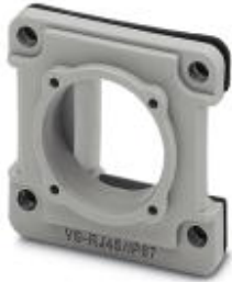
RJ45 panel mounting frame, IP67, for modular socket inserts (Keystone), for square panel cutout, with grommet, without mounting screws, color: gray

Please be informed that the data shown in this PDF Document is generated from our Online Catalog. Please find the complete data in the user's documentation. Our General Terms of Use for Downloads are valid ( http://download.phoenixcontact.com )