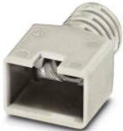
RJ45 bend protection sleeve, for pin insert VS-08-ST-RJ45, cable cross section up to 6 mm, color: gray

Please be informed that the data shown in this PDF Document is generated from our Online Catalog. Please find the complete data in the user's documentation. Our General Terms of Use for Downloads are valid ( http://phoenixcontact.com/download )