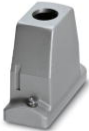
HEAVYCON ADVANCE EMV sleeve housing B16, with screw locking, height 100 mm, with 1x M32 thread, straight cable outlet

Please be informed that the data shown in this PDF Document is generated from our Online Catalog. Please find the complete data in the user's documentation. Our General Terms of Use for Downloads are valid ( http://download.phoenixcontact.com )