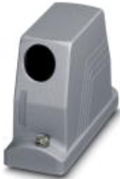
HEAVYCON ADVANCE EMV sleeve housing B24, with screw locking, height 100 mm, with 1xM32 thread, lateral cable outlet

Please be informed that the data shown in this PDF Document is generated from our Online Catalog. Please find the complete data in the user's documentation. Our General Terms of Use for Downloads are valid ( http://download.phoenixcontact.com )