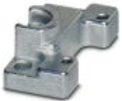
Panel mounting flange for HEAVYCON-ADVANCE TMS housing with screw locking