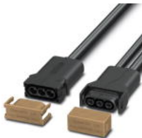
SUNCLIX micon AC Y-distributor, 3-pos., IP67, 20 A/5 A, 600 V, trunk cable: 1.15 m, drop cable: 0.5 m, incl. dust protection caps, North American version

Please be informed that the data shown in this PDF Document is generated from our Online Catalog. Please find the complete data in the user's documentation. Our General Terms of Use for Downloads are valid ( http://phoenixcontact.com/download )